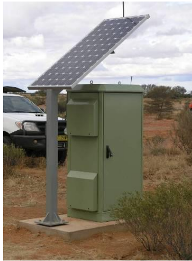
Figure 3: Solar panel acting as a shade awning at a sample Tier 2 site