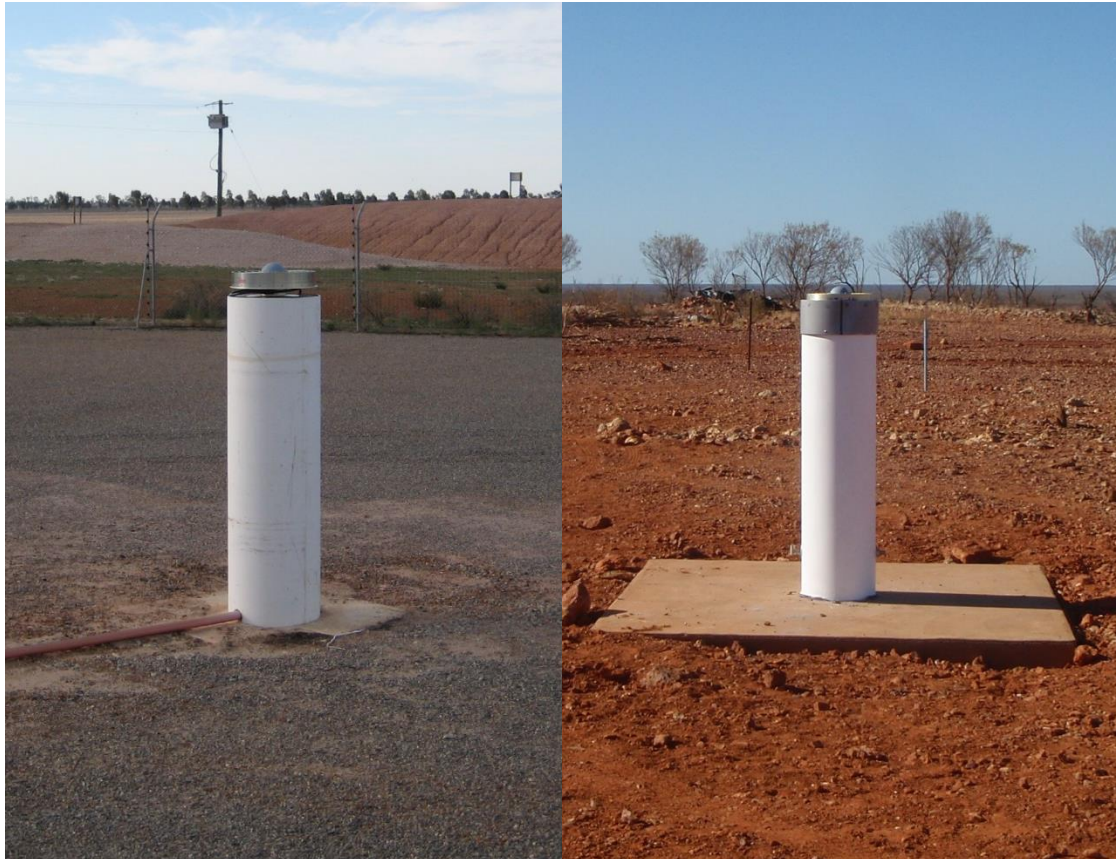
Figure 5: Sample Tier 1 and 2 CORS monuments

Figure 5 shows two examples of Tier 1 and 2 CORS antenna monuments.