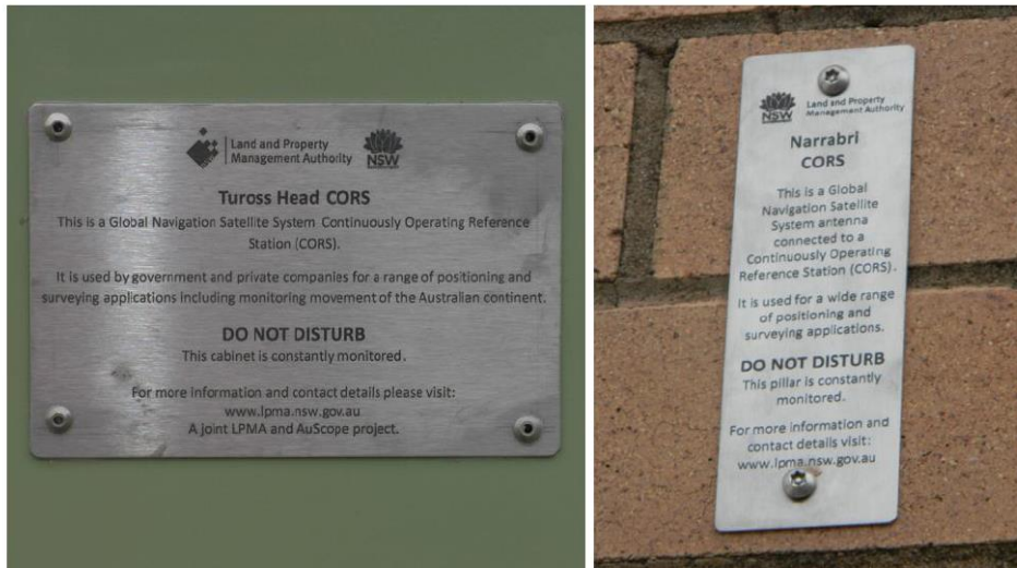
Figure 4: Example of monument inscription plaques

It is recommended to install a monument inscription plaque on or very close to the GNSS antenna monument. This plaque should state the name of the GNSS CORS and provide brief contact details of the CORS operator. This information can serve to inform the general public of the importance of the infrastructure, as well as reinforce the importance of not inadvertently interfering with the installation. Examples of such plaques are provided in Figure 4.