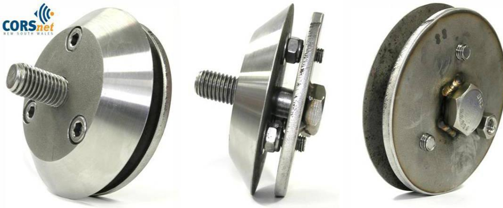
Figure 9: CORSnet-NSW adjustable antenna mount