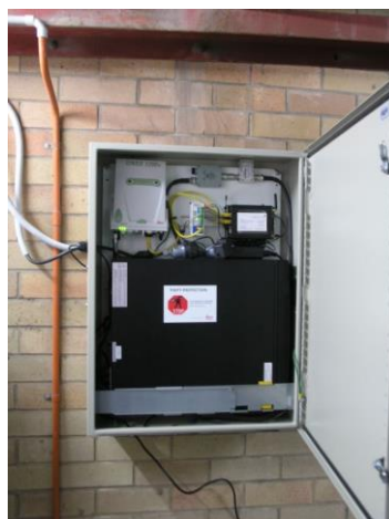
Figure 2: Sample building enclosure at a sample Tier 3 site