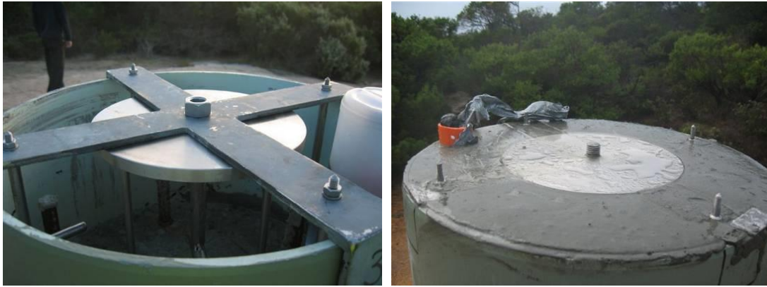
Figure 10: Antenna mount for Tier 2 AuScope CORS, under construction