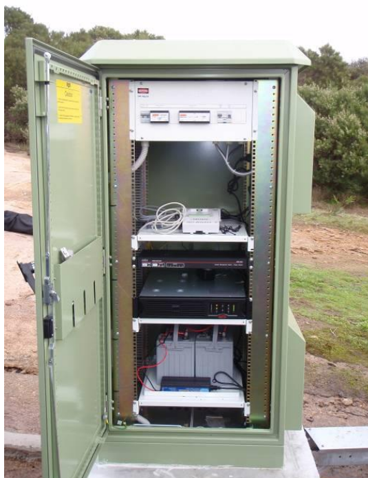
Figure 11: Power options; solar primary installation and pack-up battery installation

Dual (primary and secondary) power supplies are required for Tier 1 and 2 sites, and highly recommended for Tier 3 sites. At Tier 1 and 2 sites the secondary power supply should, at minimum, power the GNSS receiver, inline amplifiers, and automatic weather station for seven days. At more remote sites, the secondary power supply may need to power the site for a longer period to enable service or repair. Secondary power sources for sites providing