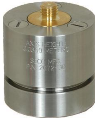
Figure 8: SECO 2072 antenna mount