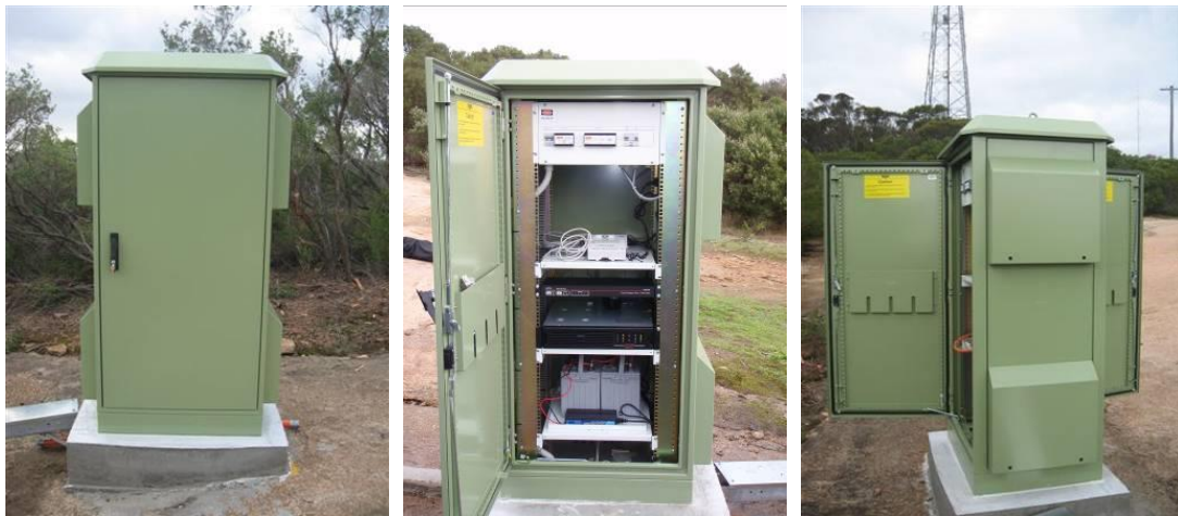
Figure 1: Locked box enclosure at a sample Tier 2 site

Electronic equipment not contained in a secure and weatherproof building may require a locked and sealed enclosure such as that shown in Figure 1, or in a building enclosure such as that shown in Figure 2. Use enclosures rated to industry standards for protection against ambient conditions and vandalism. These enclosures may need to include insulation, air conditioning or other equipment to control temperature and humidity. Locate equipment with the least tolerance of temperature extremes lower in the enclosure. Design solar panels and other external equipment to withstand local conditions. Solar panels can be used to shade the equipment enclosure as shown in Figure 3.