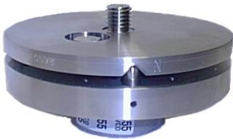
Figure 7: SCIGN antenna mount

The antenna mount connects the GNSS antenna to the monument. Once installed the antenna mount should lock the antenna in place so it cannot move or rotate. When an antenna is removed and replaced, the mount should return the antenna reference point to the same location and orientation. The antenna mount must maintain a level antenna, oriented to within 5° of true north for antenna calibrations to be effective. Using thin shims or washers allow the antenna to be oriented to true north, but will introduce a height of antenna that must be carefully communicated to data consumers to allow accurate positioning. Figure 7, Figure 8 and Figure 9 show some example CORS mounts. A survey tribrach is not considered an acceptable antenna mount.